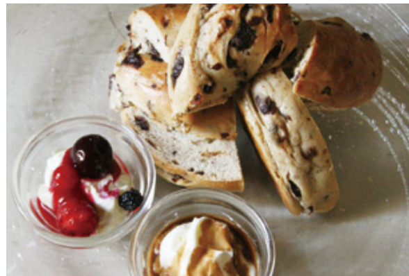
Bagel of the day ¥450