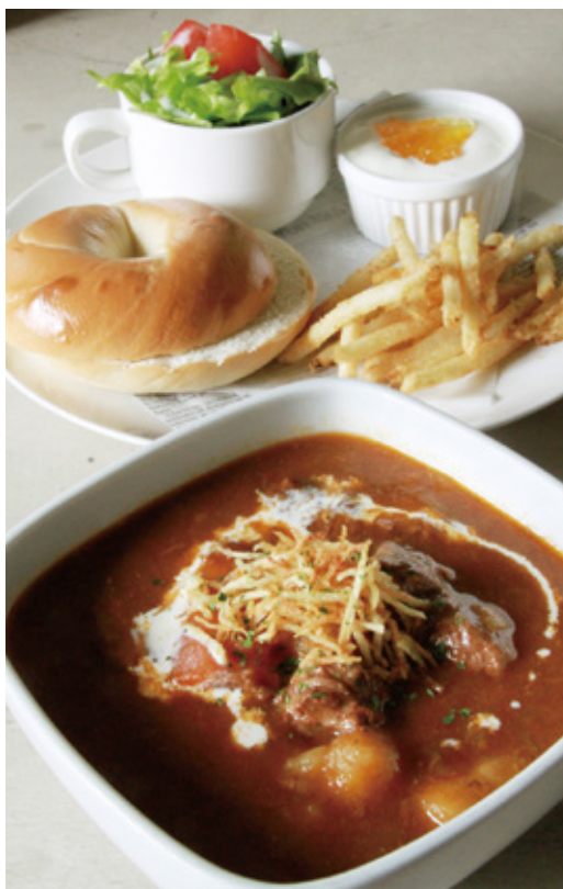
Beef Stew Set ¥1,300

Please choose from a bagel or rice as a side (salad, yogurt, french fries included)