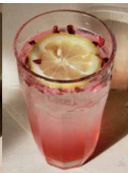
Rose Lemon Soda