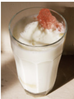
White Peach Lassi