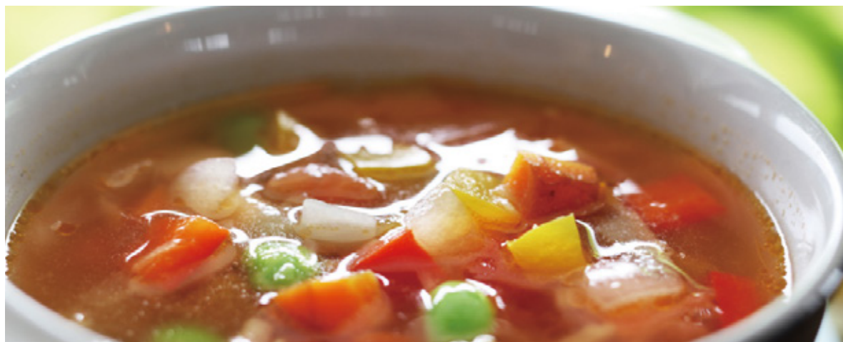
Minestrone (small ¥600 or medium ¥750 serving)

(A tomato-based soup containing lots of vegetables and bacon)