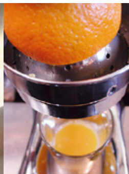
Fresh-squeezed Citrus Juice