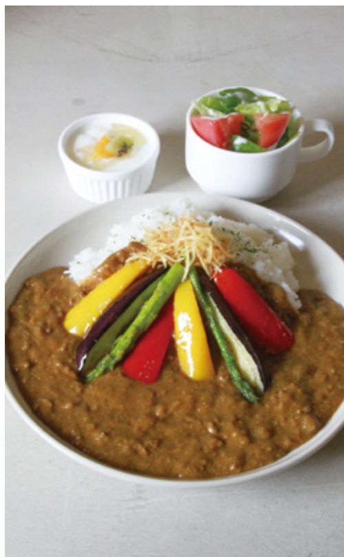
Coconut Curry Set ¥1,100

Please choose from a bagel or rice as a side (salad, yogurt, french fries included)