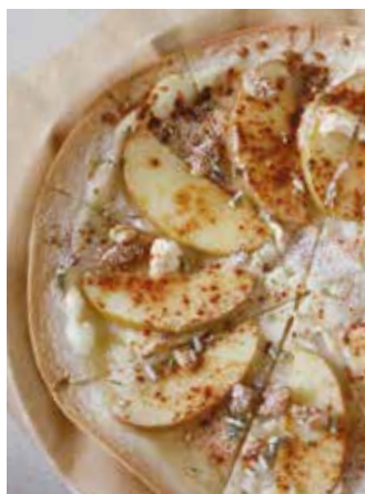
Thin-sliced Apple Pizza ¥1,000

(Apple, sour cream, sugar, honey, walnuts, cinnamon)