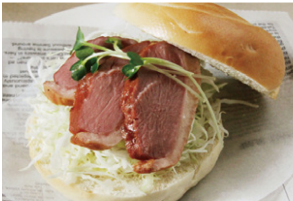
Smoked Duck Bagel Sandwich ¥650

※Can be prepared without bacon and/or mayonnaise