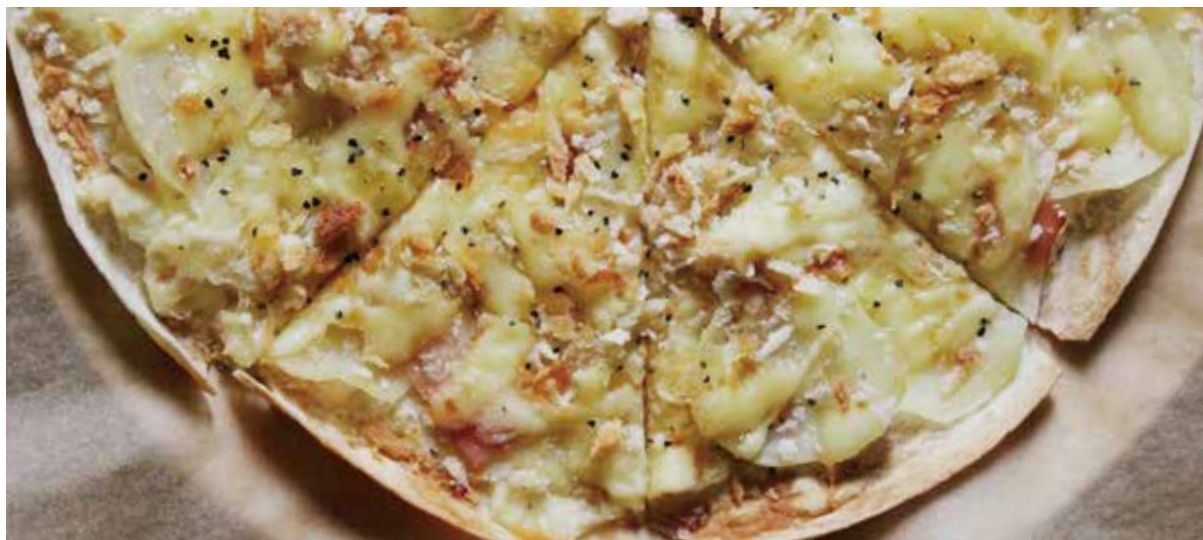
Potato Pizza ¥1,000

(Potatoes, bacon, white sauce, cheese) ※Made with beef consommé