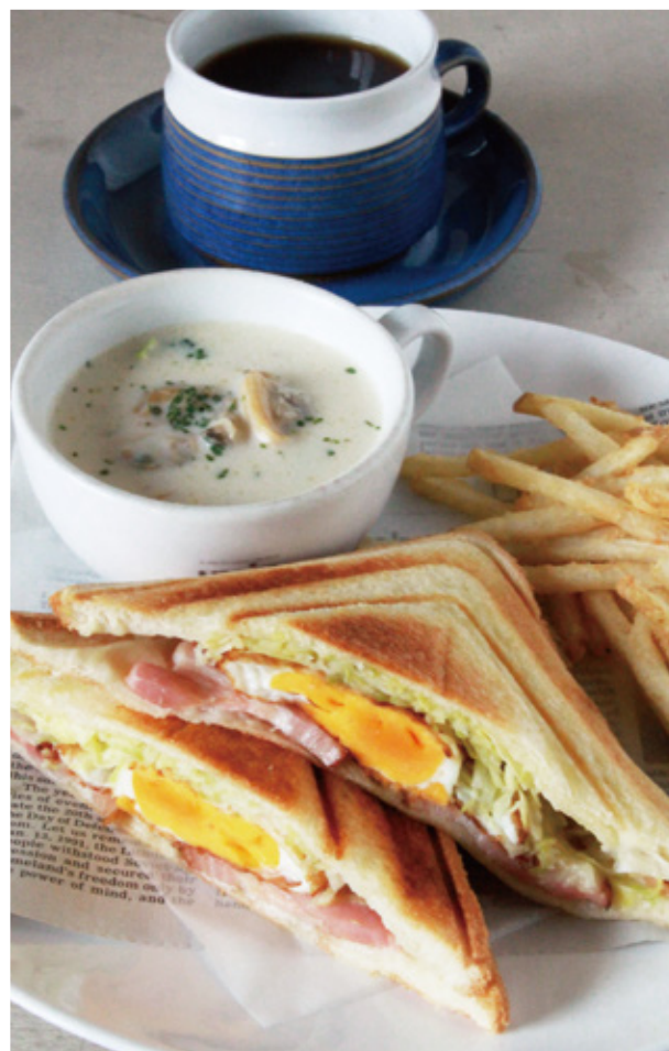
Hot Sandwich Set ¥950

※You can choose not to have eggs, bacon, or wieners