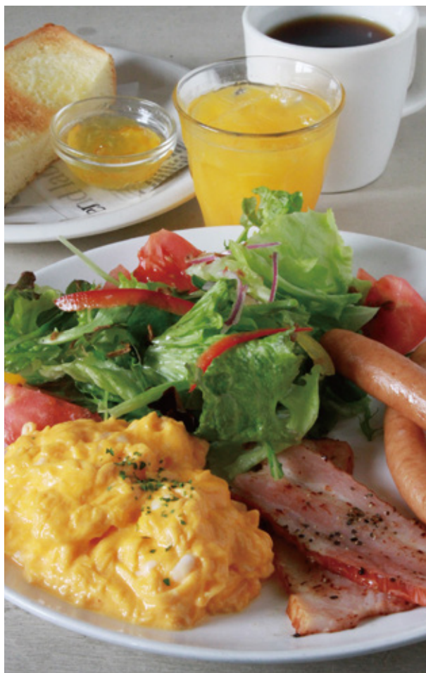
Morning Plate ¥1,100

(this menu is only available in the morning)