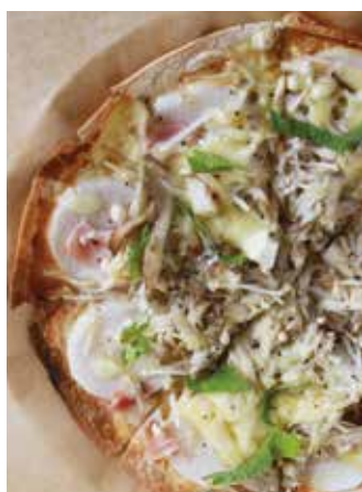
Mushroom and Mountain Yam Pizza ¥1,000

(Enoki and maitake mushrooms, mountain yam, bacon, shiso, mayonnaise, soy sauce, cheese)