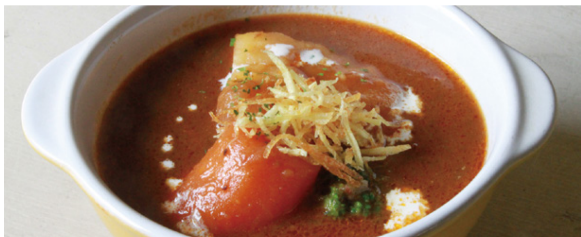
Beef Stew (small ¥600 or medium ¥750 serving)

(Beef, potatoes, onions, carrots, broccoli)