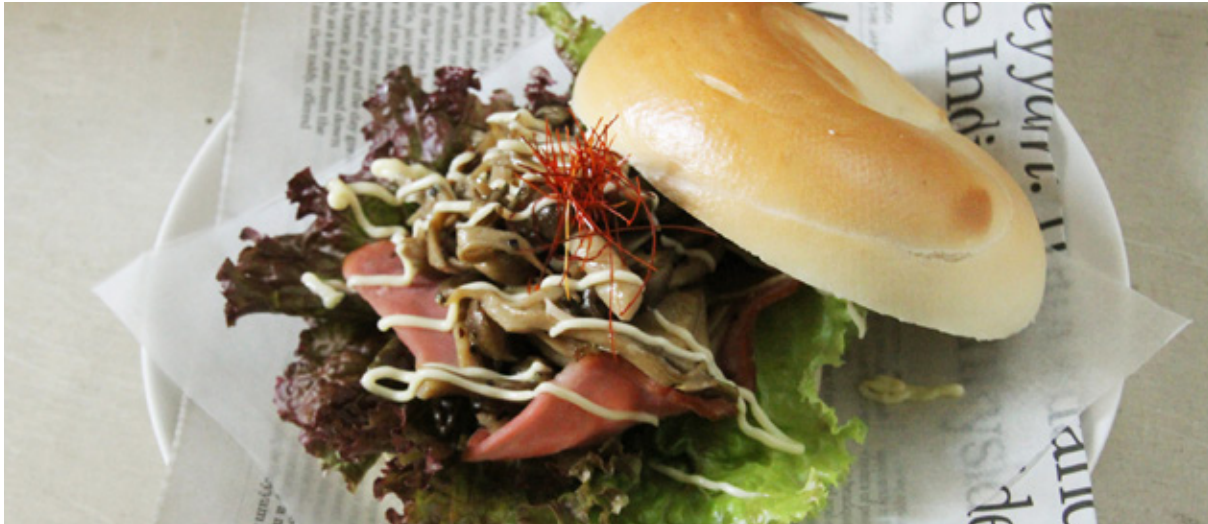
Mushroom Bagel Sandwich ¥650

(Maitake, french horn, and shimeji mushrooms, bacon, mayonnaise, lettuce)